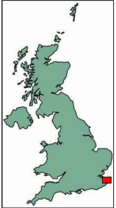
Key Plan Scale: NTS